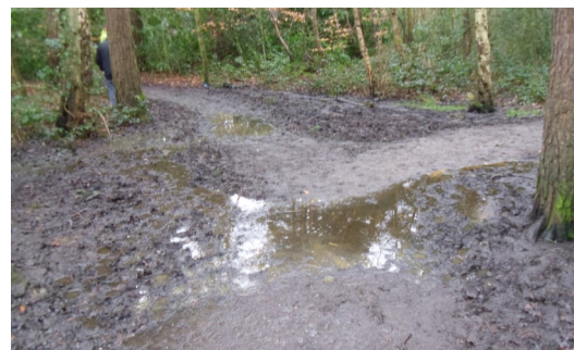
Paths before work began

Fleet Town Council has been working to install over 1200 sq metres of all-weather permeable paths; made from environmentally friendly resin bonded recycled rubber, in Basingbourne Woods. The paths were previously impassable in wet weather.