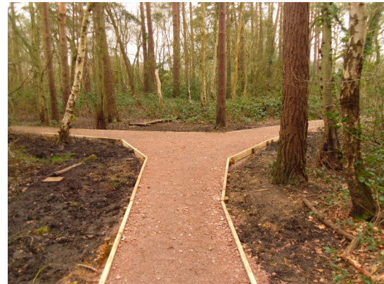
Progress towards the end of March